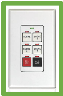
CHELSEA SWITCH: Advanced Programming OK

Currently: only the Chelsea Switch contains the firmware that can be used for advanced programming (e.g. toggling groups/ disabling override buttons/room partitions) Below contains a visual description of switch types