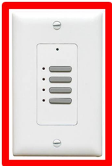
KNIGHTSBRIDGE SWITCH Not Designed for Advanced Programming

HOWEVER -The 8 button BR switch cannot be used for advanced programming.