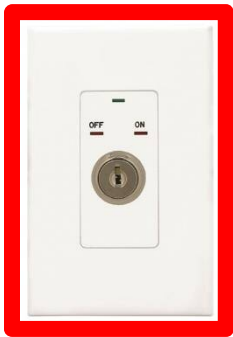
KEY DIGITAL SWITCH: Not Designed for Advanced Programming