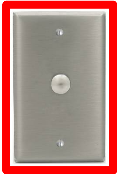
SWITCHBOLT: Not Designed for Advanced Programming